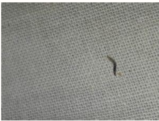
How to get fleas out of bed sheets. Can fleas live in bed sheets. Tapeworm flea eggs on bed sheets. Flea dirt flea eggs on bed sheets.